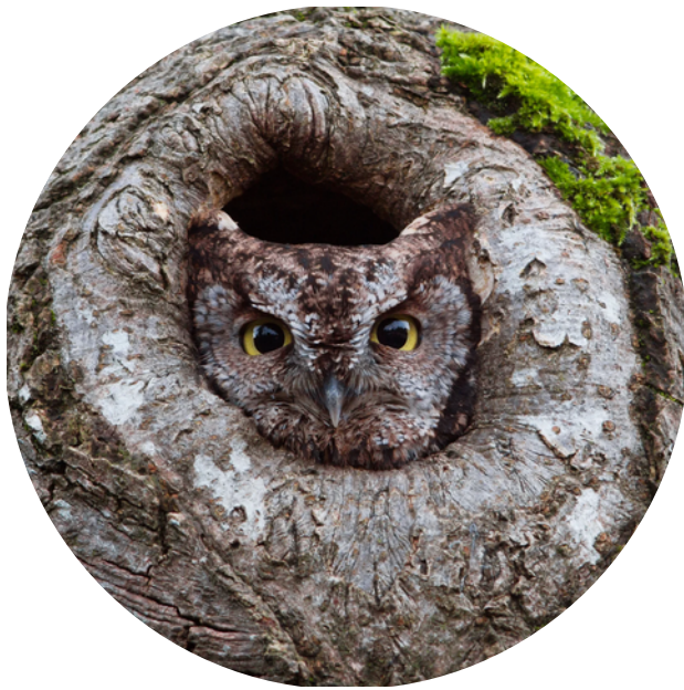
Western Screech Owl in Cavity, Ken Shults