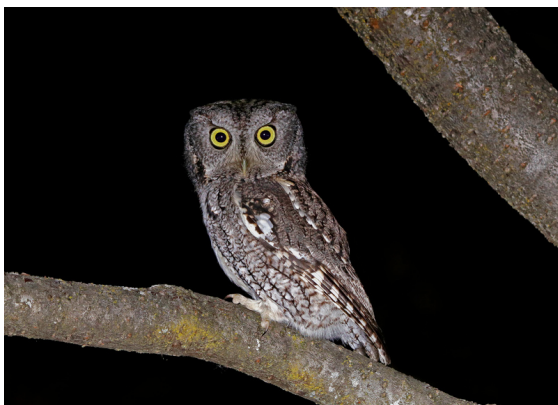
Eastern Screech Owl, Tyler Pockett

This survey aims to collect more data on the locations, abundance, and habitat types of Screech Owls through citizen science so conservation needs can be established and efforts to preserve these species can be improved.