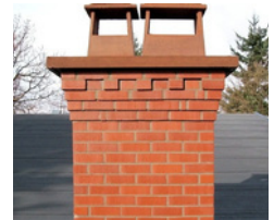
Appears closed or open