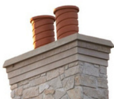
Appears open with clay or terra cotta liners