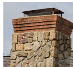
Appears closed by animal guard/ spark protector